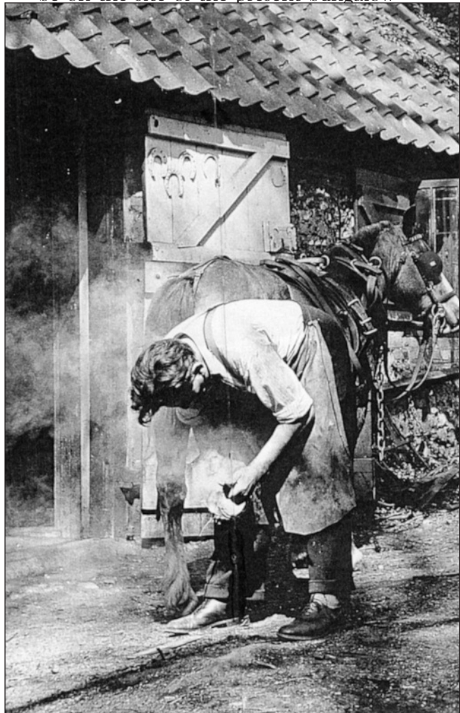
A typical forge