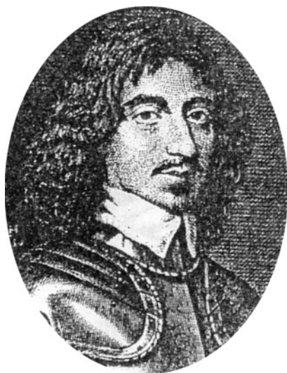
Sir Thomas Fairfax